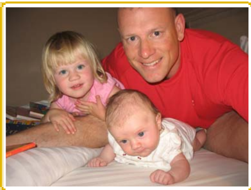
My Daddy is in Iraq helping people.